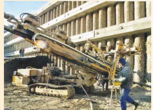
Drill equipment for anchors