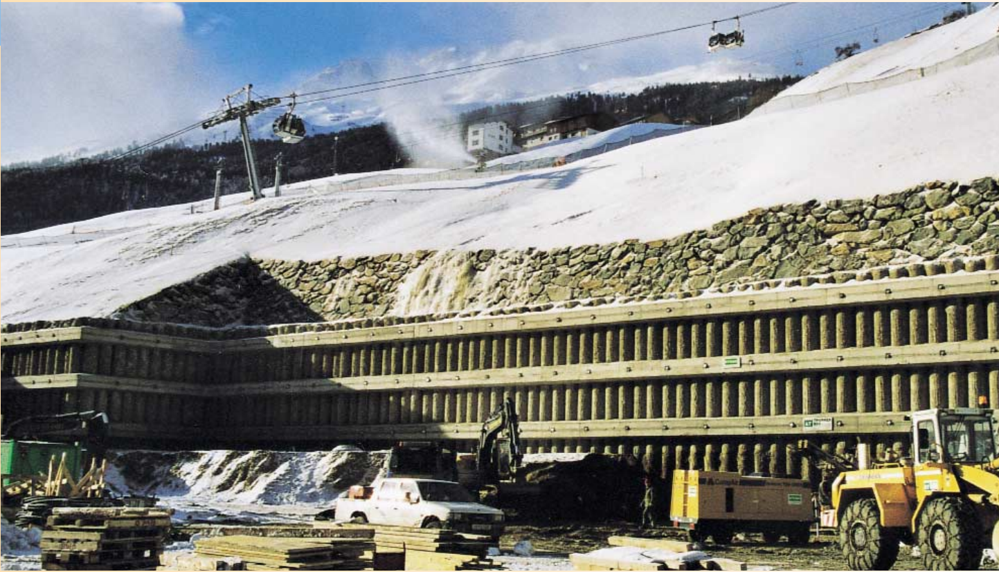
Excavation of parking garage Giggijoch, Soelden, Austria